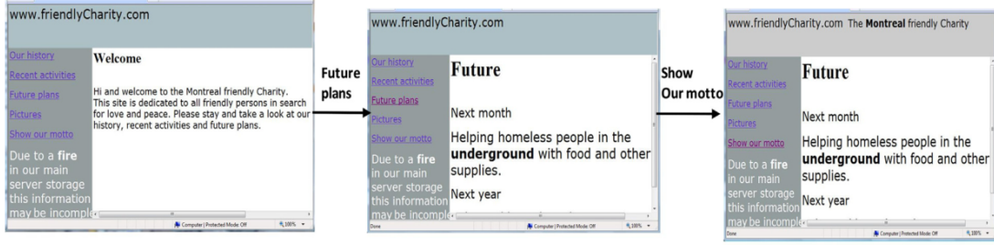
Figure 3: Counterexample found by the tool.